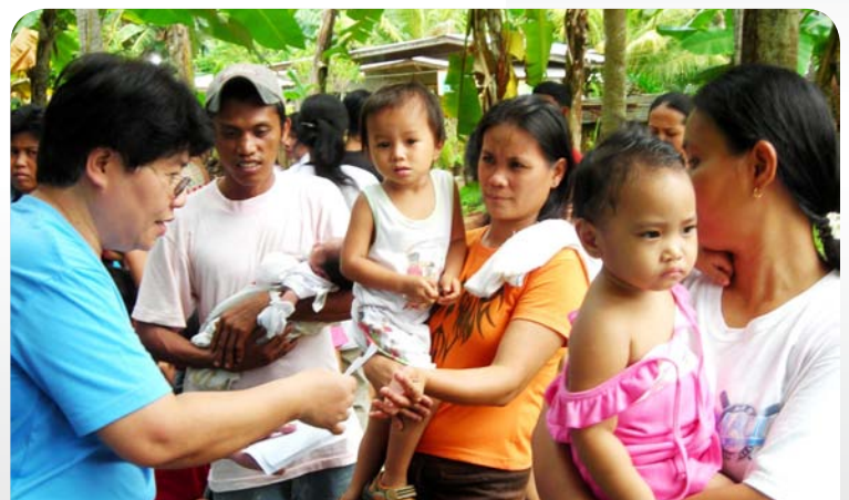
A health worker provides free advice and medical consultations in the Philippines

“Free and open source software doesn’t fix all the problems but makes their solutions possible.”